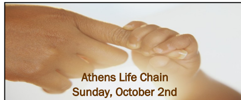
Athens Life Chain Sunday, October 2nd 2:00 - 3:00 p.m. UGA Arch