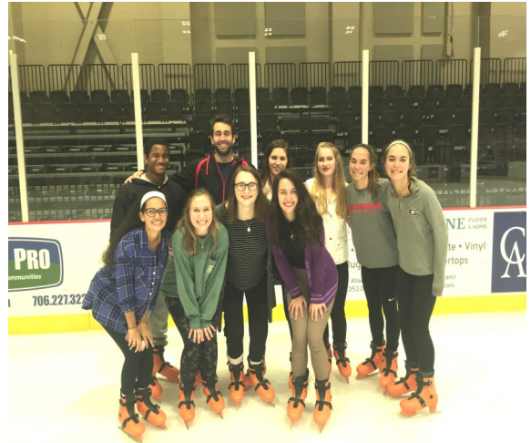
Several students from the Freshman Ignite program ice skating before Finals Week.

If you are looking for something to spark your faith life and find your calling in this world, come discover it at Atlanta Awakening 8! Awakening is a weekend-long Catholic retreat for young adults put on by young adults throughout the country. The retreat is designed to awaken your faith, bring you fellowship, and to strengthen your relationship with God. ATLA8 is on January 27-29, 2017 at LifeTeen Covecrest. If you are interested in this amazing opportunity, please check out our website at https://atlawakening.wordpress.com/