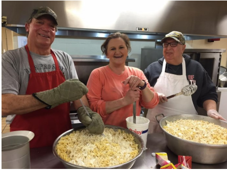
Thank you to these awesome volunteers for helping Persia at our Sunday night Student dinner!