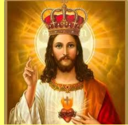
The Solemnity of Our Lord Jesus Christ, King of the Universe

Commonly referred to as the Feast of Christ the King , is a relatively recent addition to the Western liturgical calendar. Having been instituted in 1925 by Pope Pius XI for the Roman Catholic Church. In 1970 its Roman Catholic observance was moved to the final Sunday of Ordinary Time. Therefore, the earliest date on which it can occur is November 20 th and the latest is November 26 th . Traditional Catholics observe it on its original date, the last Sunday of October. The Anglican, Lutheran, and many other Protestant churches adopted it along with the Revised Common Lectionary, occasionally referring to it as Christ the King Sunday. It is also observed on the same computed date as the final Sunday of the ecclesiastical year, the Sunday before the First Sunday of Advent.